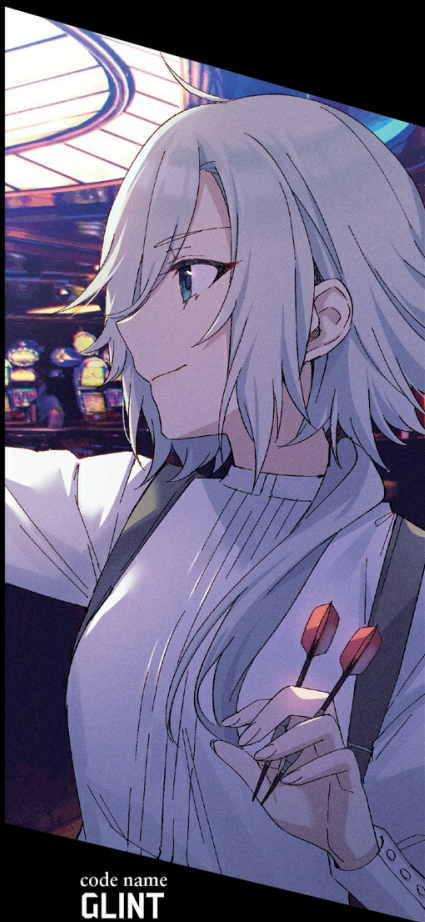
code name GLINT