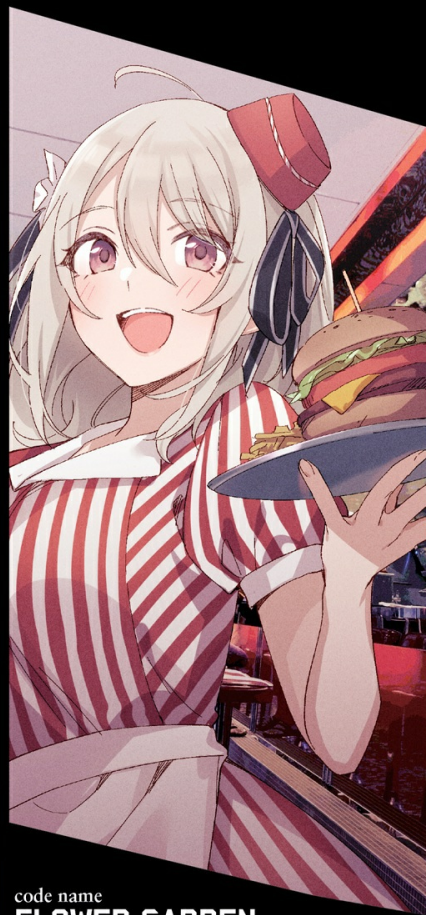
code name FLOWER GARDEN