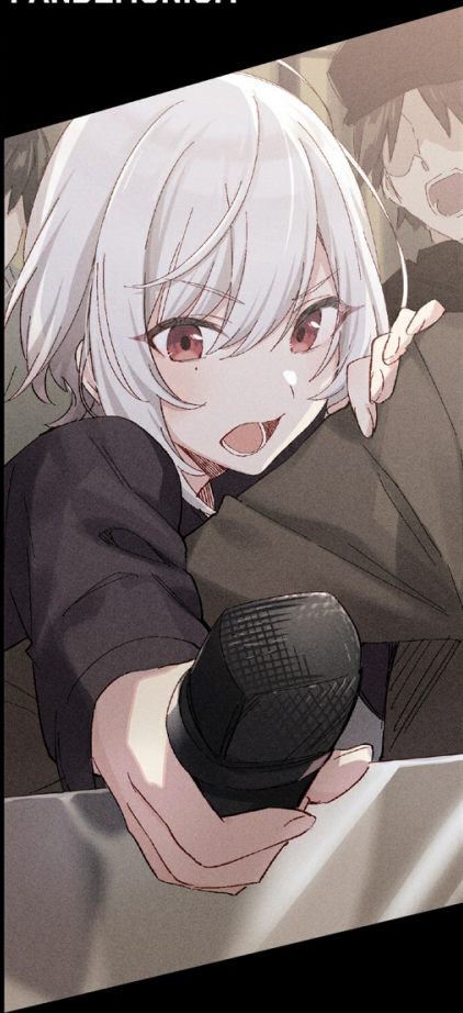
code name PANDEMONIUM