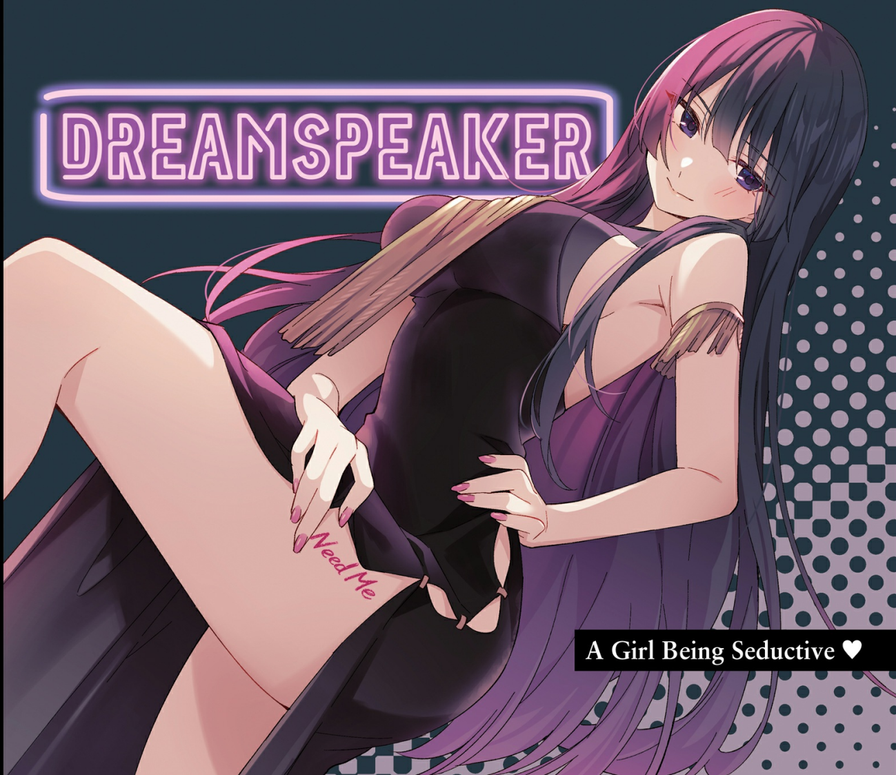
A Girl Being Seductive ♥